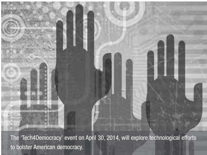
The 'Tech4Democracy' event on April 30, 2014, will explore technological efforts to bolster American democracy.