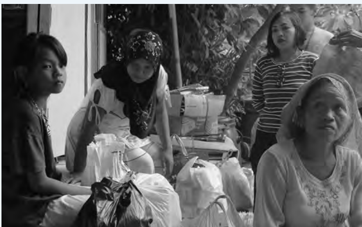
Members of the RT14 community in their first waste collection weigh-in at the Bank Sampah in Indonesia.