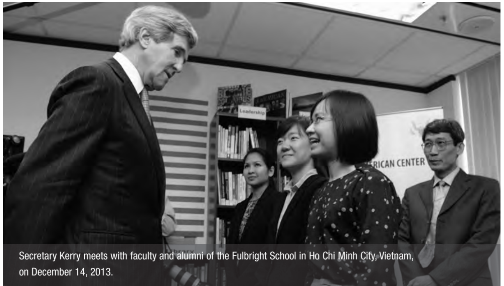
Secretary Kerry meets with faculty and alumni of the Fulbright School in Ho Chi Minh City, Vietnam, on December 14, 2013.

The Roy and Lila Ash Center for Democratic Governance and Innovation advances excellence and innovation in governance and public policy through research, education, and public discussion. Three major programs support our mission: the Program on Democratic Governance; the Innovations in Government Program; and the Rajawali Foundation Institute for Asia. The Ford Foundation is a founding donor of the Center.