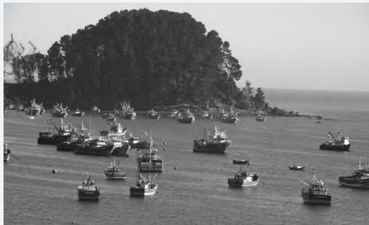
Boats on Coliumo Bay just outside of Dichato in southern Chile demonstrate the region's economic engine. The Recupera Chile initiative is working with the community to investigate aquaculture alternatives to restore livelihoods and combat overfishing.

Fundamental to the J-term course and the operations of the Harvard initiative is the concept that recovery is a multifaceted phenomenon. Recupera Chile, therefore, also focuses on families affected by the largest displaced persons camp in the country, also in Dichato, by addressing the social, mental, and physical health needs of the people in the town. In addition to providing health screenings, case management services, and ongoing support to the municipal government, the Recupera Chile team is developing a new education concept. The project, called the Innovative School, provides high quality education and introduces environmental and tsunami-safety concepts to children at an early age.