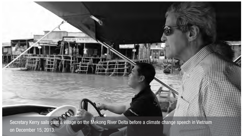
Secretary Kerry sails past a village on the Mekong River Delta before a climate change speech in Vietnam on December 15, 2013.