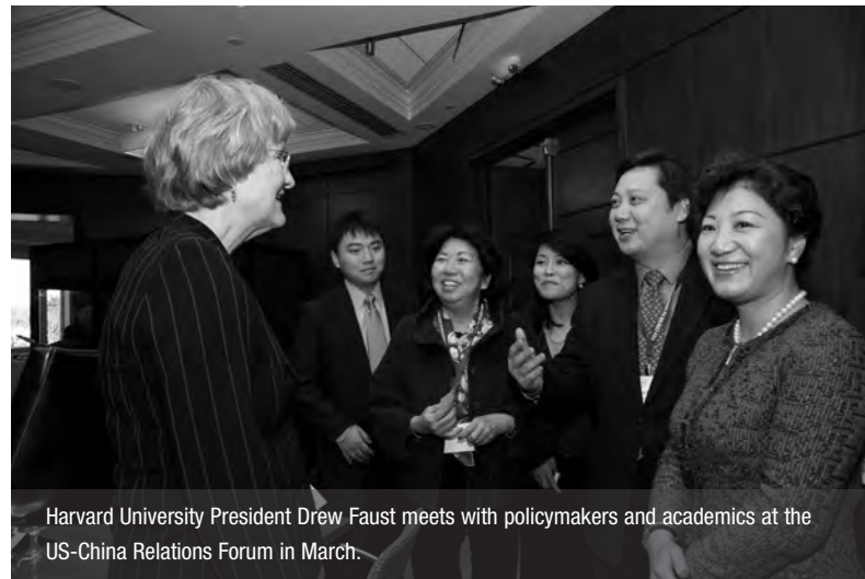
Harvard University President Drew Faust meets with policymakers and academics at the US-China Relations Forum in March.