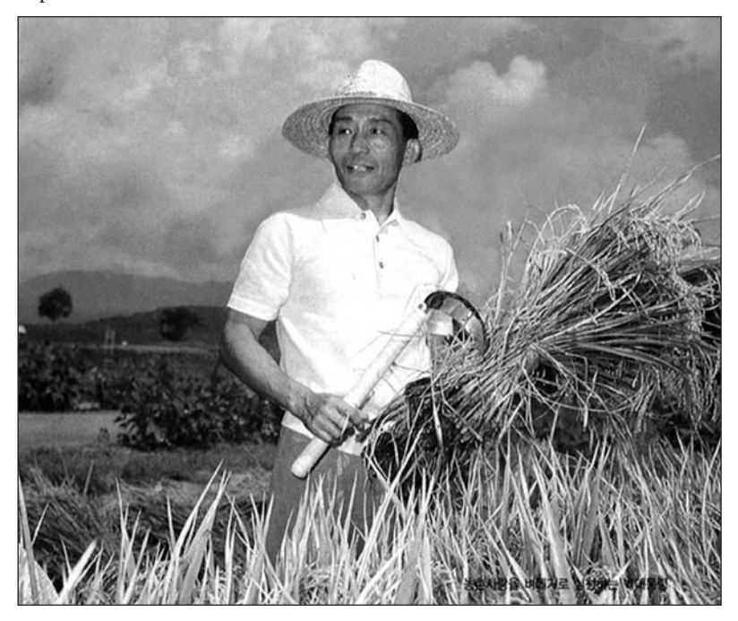
President Park harvests rice — Korea attained rice self-sufficiency in 1976

among individual farmers to maximize its use and to spread out the financial burden of purchasing a machine. President Park was involved at every step of the process and knew every detail of the policies, even making sure that a network of after-sale service was established so that farmers could easily access maintenance and repair services.