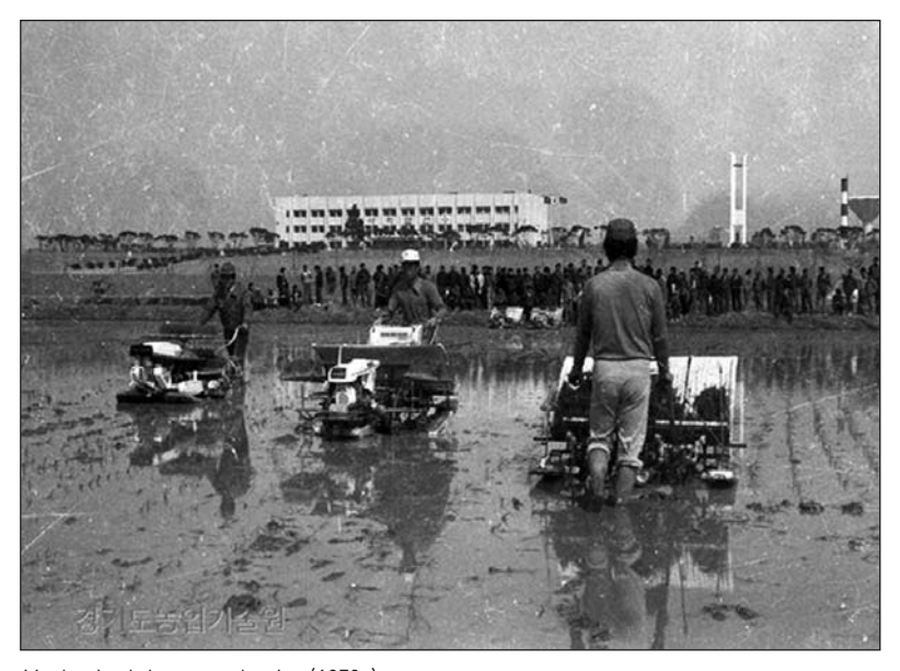
Mechanized rice transplanting (1970s)

machines, which were not readily available in Korea due to its underdeveloped machinery industry.