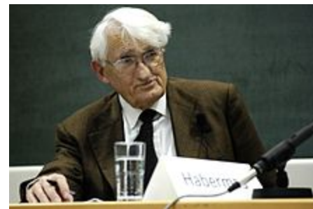
Photograph of Jürgen Habermas, whose theory of discourse ethics was influenced by Kantian ethics

German philosopher Jürgen Habermas has proposed a theory of discourse ethics that he claims is a descendant of Kantian ethics. [49] He proposes that action should be based on communication between those involved, in which their interests and intentions are discussed so they can be understood by all. Rejecting any form of coercion or manipulation, Habermas believes that agreement between the parties is crucial for a moral decision to be reached. [50] Like Kantian ethics, discourse ethics is a cognitive ethical theory, in that it supposes that truth and falsity can be attributed to ethical propositions. It also formulates a rule by which ethical actions can be determined and proposes that ethical actions should be universalisable, in a similar way to Kant's ethics. [51]