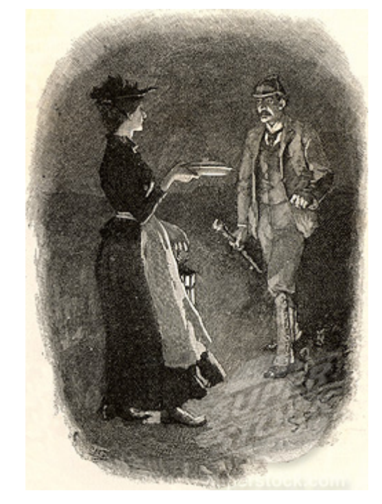
Curried mutton and a suspect: Toward a smoking gun test? (Table 5)

"Can you tell me where I am?' he asked. 'I had almost made up my mind to sleep on the moor when I saw the light of your lantern.'