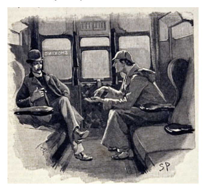
Holmes outlines the case.

I lay back against the cushions, puffing at my cigar, while Holmes, leaning forward, with his long, thin forefinger checking off the points upon the palm of his left hand, gave me a sketch of the events which had led to our journey.