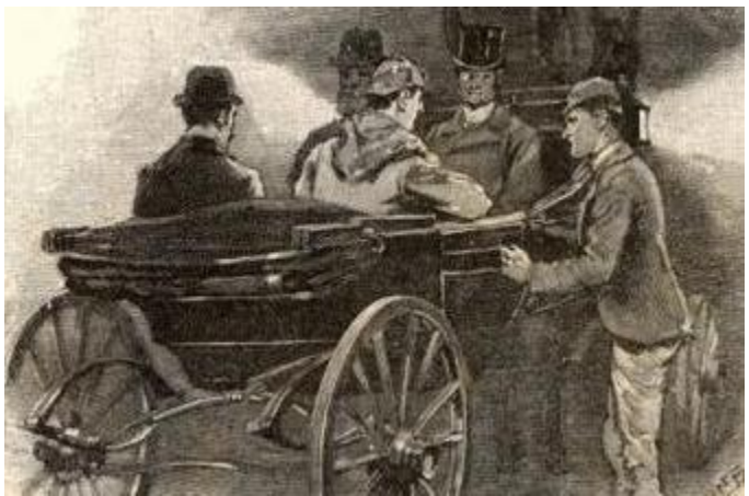
Holmes discusses lame sheep with stable boy – an auxiliary outcome test. (Table 7)

"Have you noticed anything amiss with them of late?"