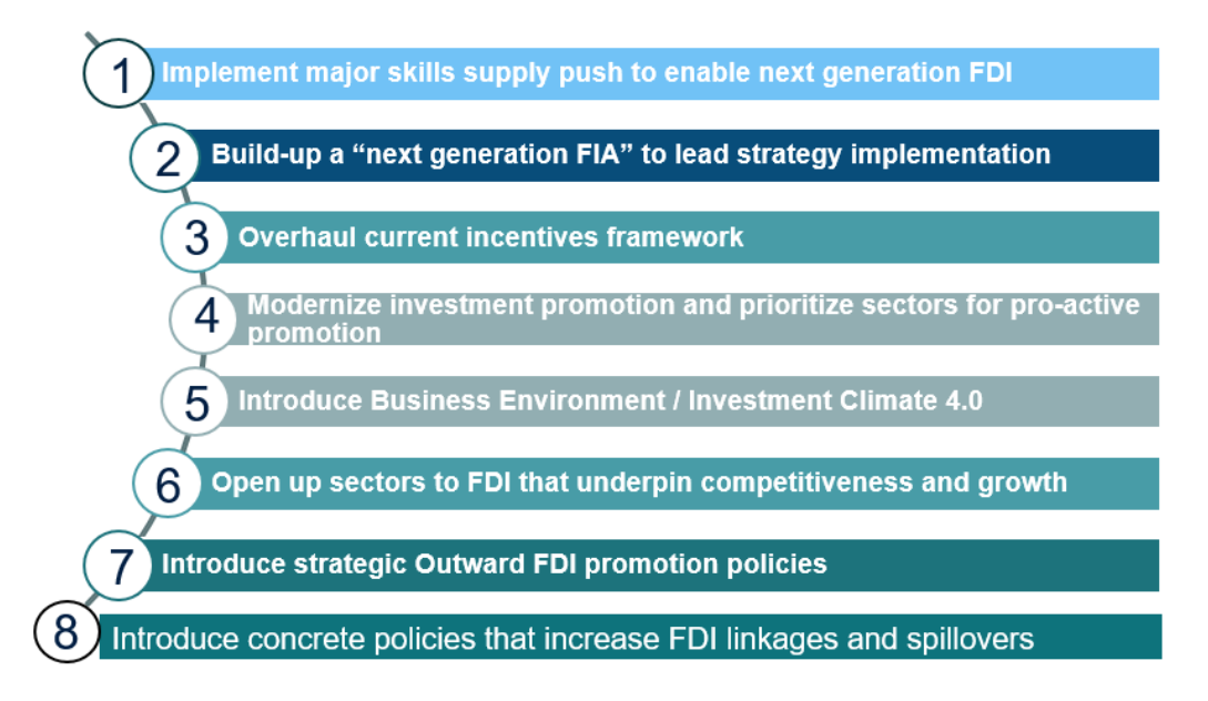
Figure 4: Eight breakthrough reforms for next-generation FDI